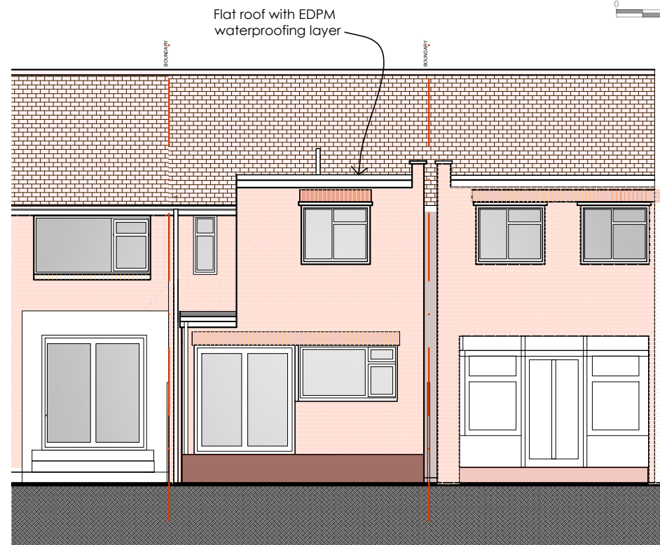
PROPOSED REAR ELEVATION (WEST)