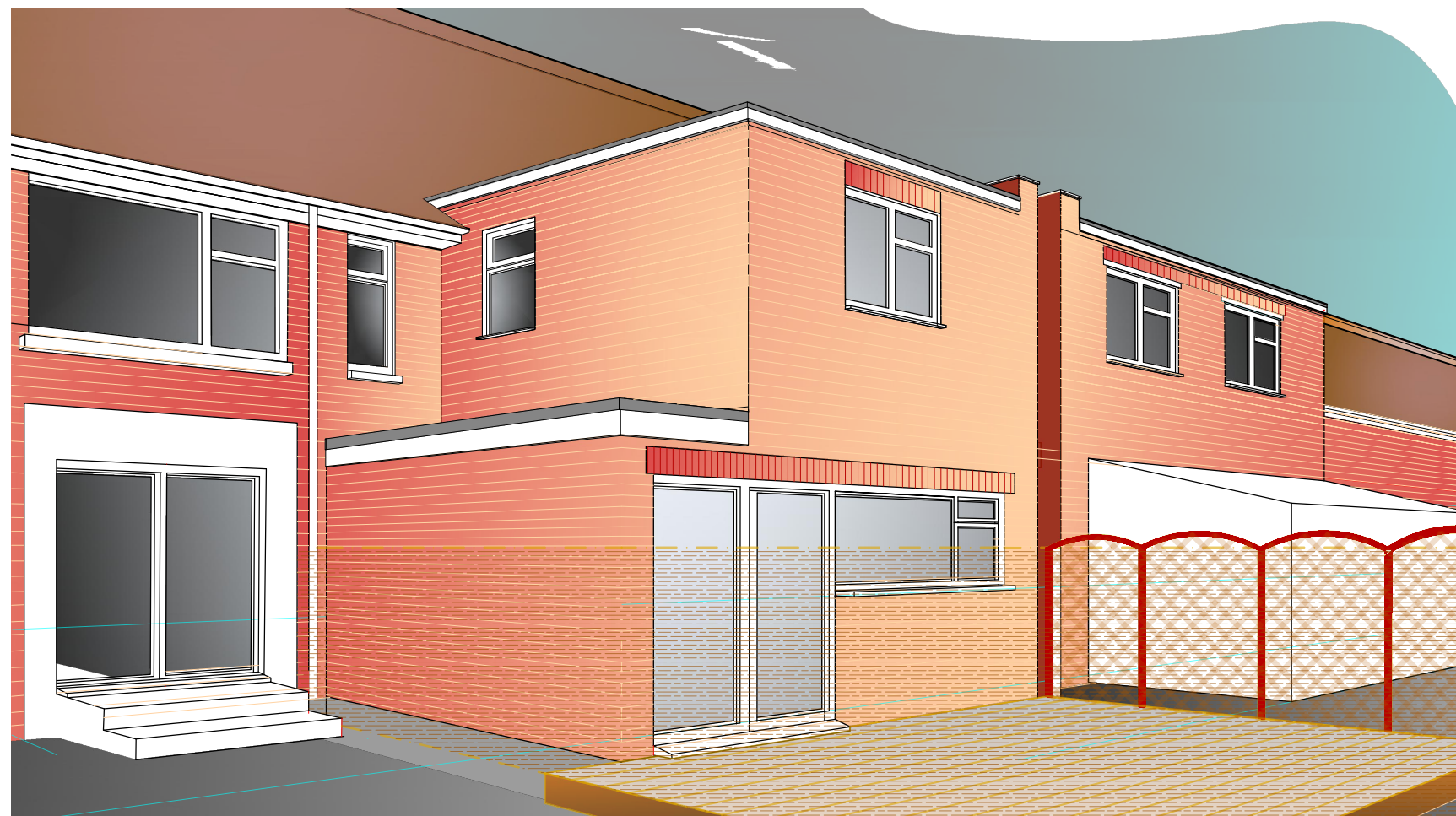
PROPOSED PERSPECTIVE VIEW (NTS)